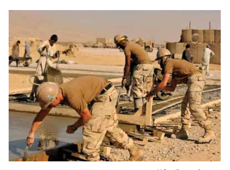
U.S. sailors and Afghan contractors building helicopter landing pads at base in Afghanistan.

part of the "total force" for contingency operations. But the declared total-force policy that includes contractors is at odds with agencies' failure to plan for their reliance on contractors. During Commission discussions with the Defense Assistant Deputy Undersecretary (Program Support), he suggested the need for joint planners to include contractors in the military's time-phased force-deployment requirements. DoD's failure to meaningfully emphasize operational contract support in the 2010 Quadrennial Defense Review (QDR) was a lost opportunity to signal its importance for future strategic planning and execution.