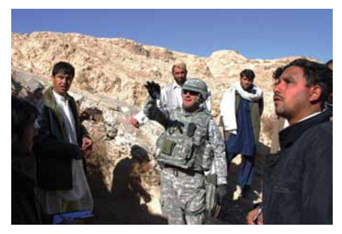
Provincial Reconstruction Team at erosion-control project near Qalat, Afghanistan (U.S. Air Force photo, Dec. 2010).

into many long-term support contracts. The contracting flexibilities allowed by law, including exemptions from most competition requirements, are useful at the onset of a contingency. However, as the contingency-contracting environment matures, agencies should introduce more competitive practices. Competitive approaches would include looking for opportunities to transition to fixed-price contract types that will broaden the pool of qualified contractors and ensure more equitably balanced risks.