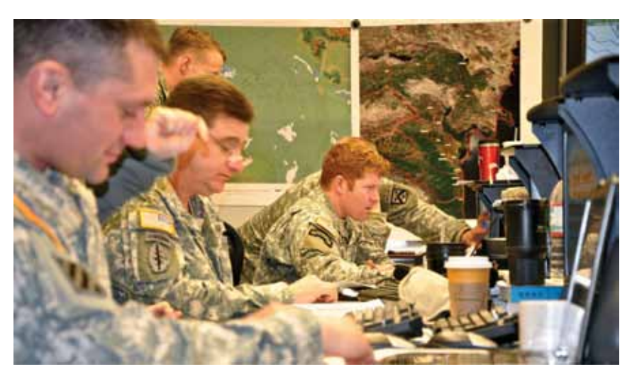
Training exercise at Army Command and General Staff College.

Assume responsibility as the overseas executive agent for managing major contingency-operation facilities and the contractors that support them. Congress should provide the Installation Management Command with adequate funds and the resources necessary to assume the responsibility for improving process accountability, ownership, and control over the contingency-installation management function.