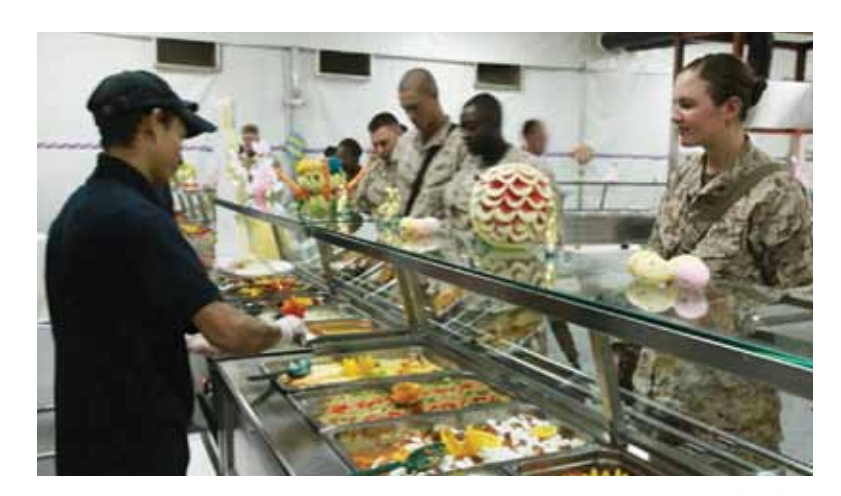
Contractor serving lunch at Camp Leatherneck, Afghanistan (U.S. Marine Corps photo, April 2010).

monitored its competition level on contingency contracts and adjusted internal policies to increase participation by qualified host-nation contractors whenever possible. In contrast, stateside contracting activities are not required to separately monitor contingency-competition levels, even though these offices obligate billions of contingency dollars per year on contracts.