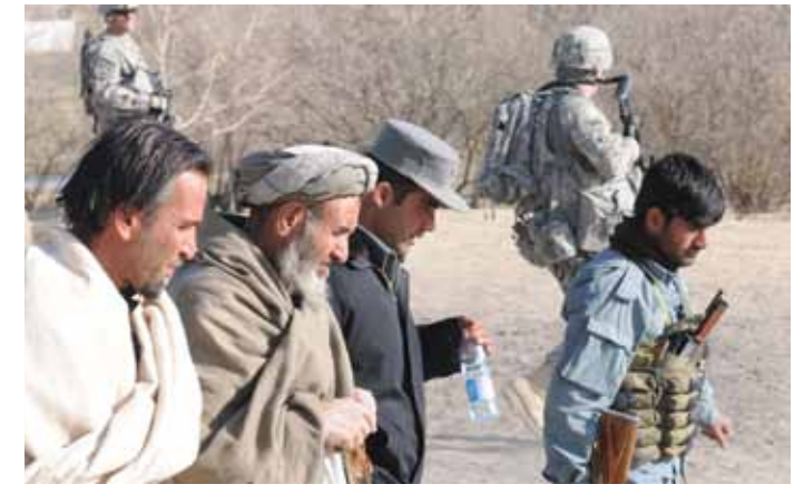
Afghan police officer and U.S. soldiers with village elders, Afghanistan (, Dec. 2010).

Camp mayors often have limited experience in fulfilling their installation and contractor-management functions, yet an organization with the necessary expertise already exists. Despite having developed this expertise through years