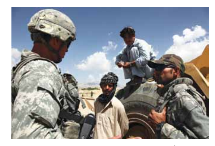
Army officer with Afghan contractors.

contract supports operational strategy, and whether cost control on the current contract is successful. This determination should lead to new fixed-price competitions for the major subcontract requirements, negotiations with the incumbent to transition from cost-reimbursement to fixed-price payment terms, or continuation of the existing contract. All exercised options must meet this competition-advocate review requirement.