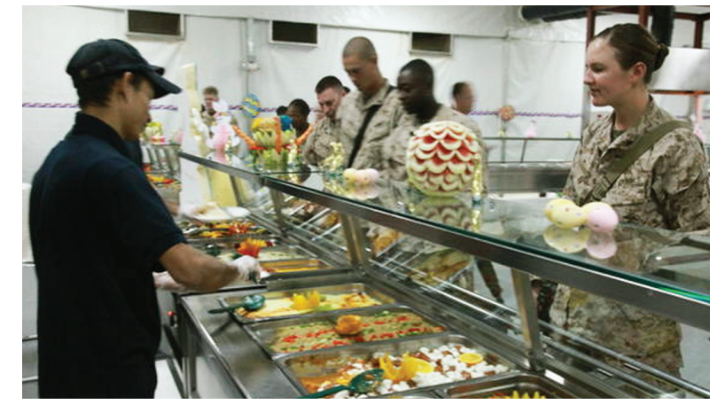
Contractor serving lunch at Camp Leatherneck, Afghanistan (U.S. Marine Corps photo, April 2010).

monitored its competition level on contingency contracts and adjusted internal policies to increase participation by qualified host-nation contractors whenever possible. In contrast, stateside contracting activities are not required to separately monitor contingencycompetition levels, even though these offices obligate billions of contingency dollars per year on contracts.