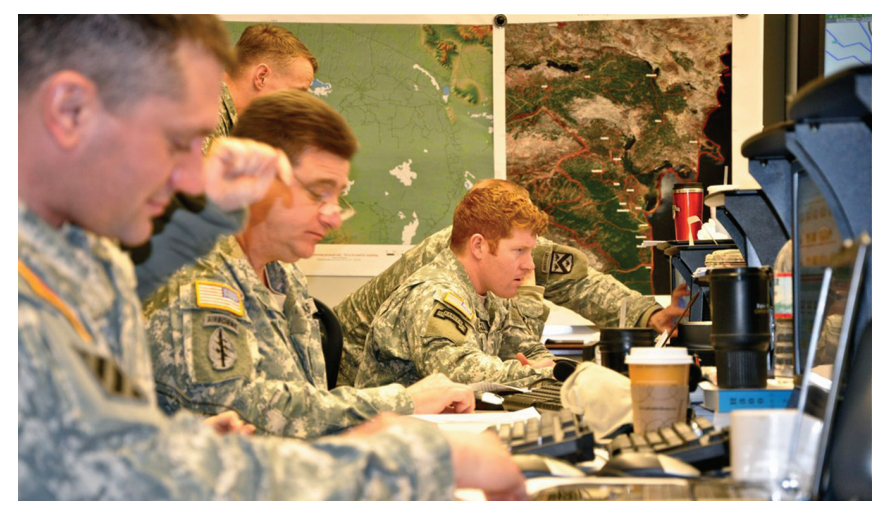
Training exercise at Army Command and General Staff College.

Assume responsibility as the overseas executive agent for managing major contingency-operation facilities and the contractors that support them. Congress should provide the Installation Management Command with adequate funds and the resources necessary to assume the responsibility for improving process accountability, ownership, and control over the contingency-installation management function.