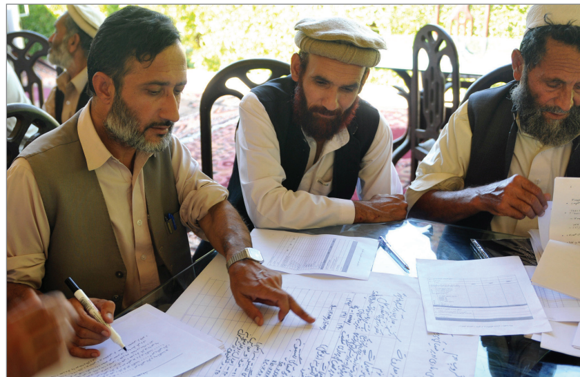
Afghan district and provincial leaders at a CERP workshop, Nangarhar Province.