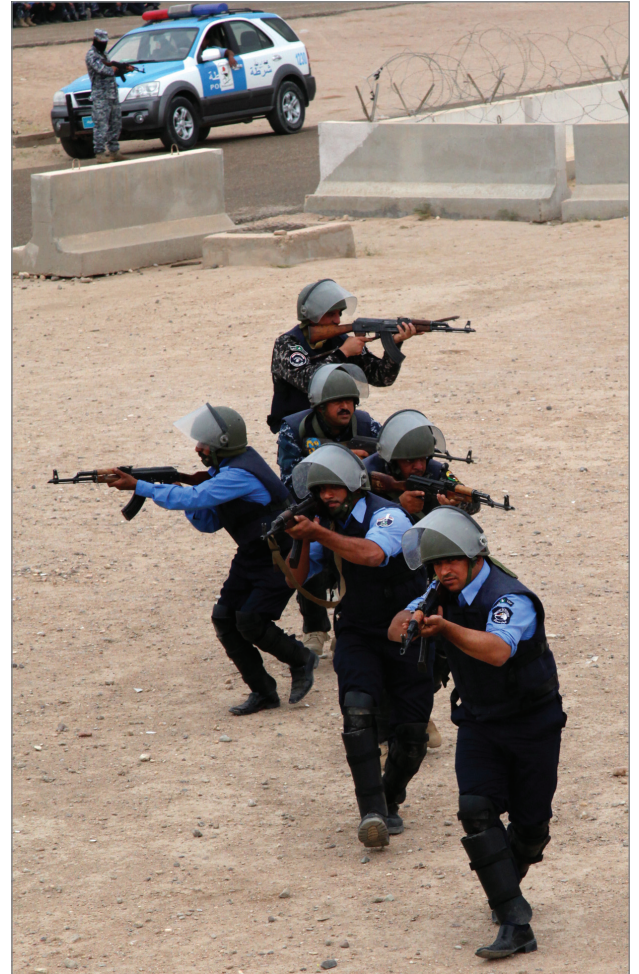
Iraqi police trainees, Basra, Iraq, 2011.

In Afghanistan, training the police is a monumental task due to high attrition rates, corruption, illiteracy, and sustainability challenges. Adding to the complexity, Defense and State initially spread these responsibilities across three contracts: training conventional police, training border police, and building capacity at the Ministry of Interior.