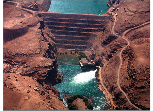
Kajaki Dam, Helmand Valley, Afghanistan, 2004.

Because Defense, State, and the International Security Assistance Force (ISAF) coalition deemed progress on the dam a vital COIN interest, USAID has been spending millions of dollars in an attempt to keep the project moving forward. By the time it is completed, USAID will have spent a substantial amount of money trying to maintain project momentum: paying for helicopters to fly in heavy construction materials and equipment, fielding numerous armed guards, and sustaining a barebones construction crew on site, all in addition to what was budgeted for the entire project at its inception.