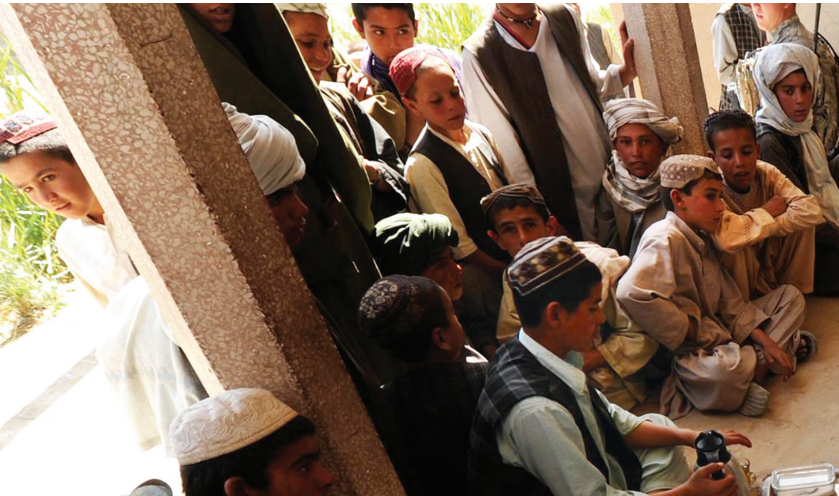
U.S. military and civilians with villagers near Kandahar, Afghanistan.