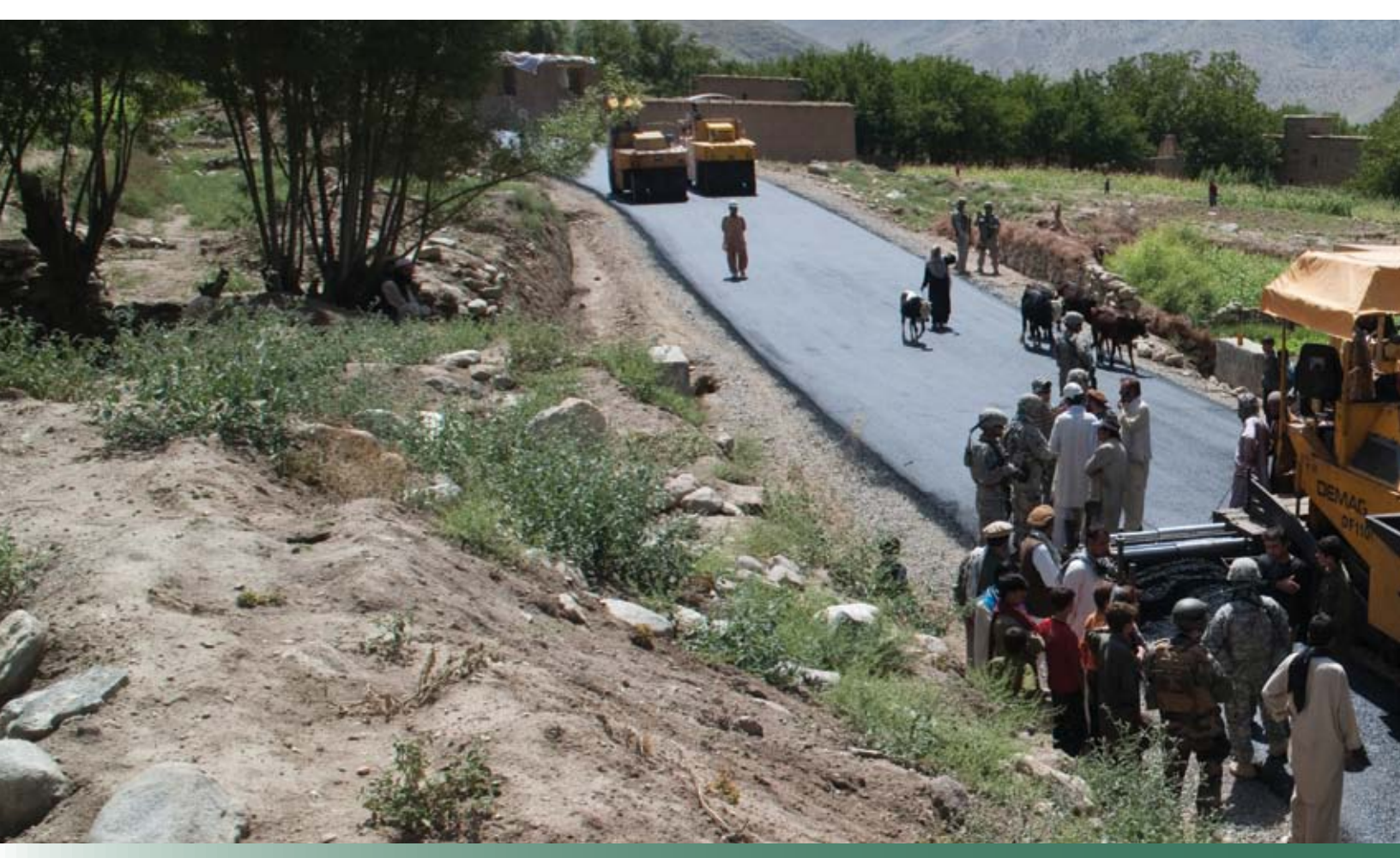
Road construction, Kapisa province, Afghanistan.