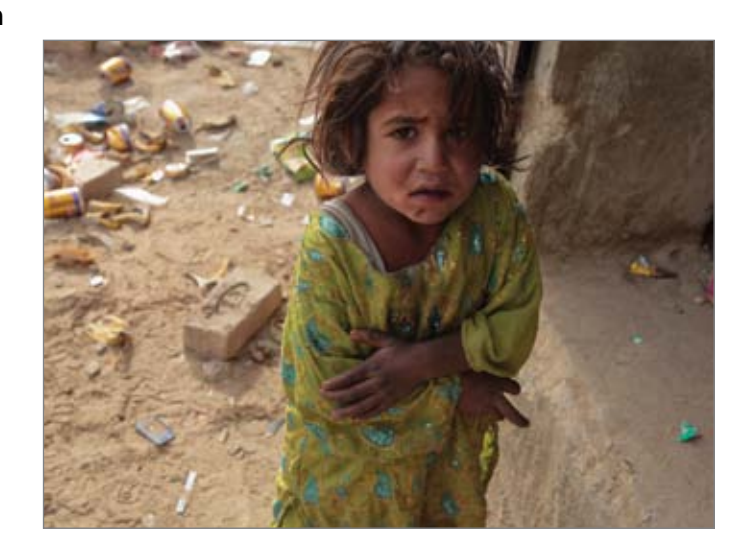
Afghan girl asking for food, Kandahar province, Afghanistan.

• is one of the world's most underdeveloped countries, with a per capita gross domestic product (GDP) of about $900, a 70 percent illiteracy rate, and an average life expectancy of 45 years;<sup>26</sup>