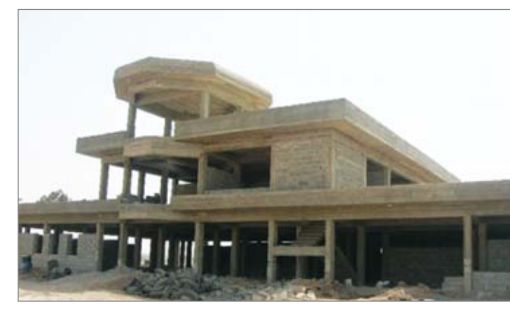
Kahn Bani Sa'ad Correctional Facility, Iraq, at the time of Parsons' termination, 2006.

The United States unilaterally transferred the Kahn Bani Sa'ad Correctional Facility to the government of Iraq on August 1, 2007, even though that country's Ministry of Justice had made clear it had no intention of completing, occupying, or securing the $40 million project, which was still unfinished and had major construction deficiencies documented by the U.S. Army Corps of Engineers.<sup>11</sup>