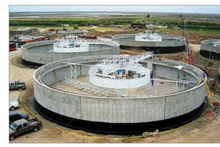
The Nassiriya watertreatment plant, Iraq, 2007.

Considering that the Nassiriya plant is the largest single U.S.-funded reconstruction project in Iraq, and that its goals included