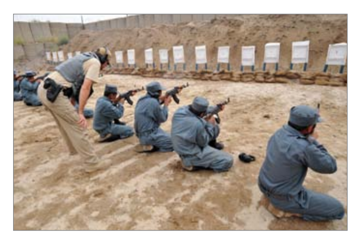
DynCorp trainer with Afghan National Police recruits.

Prospects for the Afghan government's sustaining the ANSF are dubious. The entire country's gross domestic product (GDP) for FY 2011 is about $16 billion at the official exchange rate, and the national government's domestic revenues are about $2 billion.<sup>23</sup> The Afghan Ministry of Finance budget proposal for 2011-2012 indicates that given the increased security costs from the increase in size of the ANSF, the Afghan government is expected to continue to depend on donor grants for up to 30% of its operating budget.<sup>24</sup>