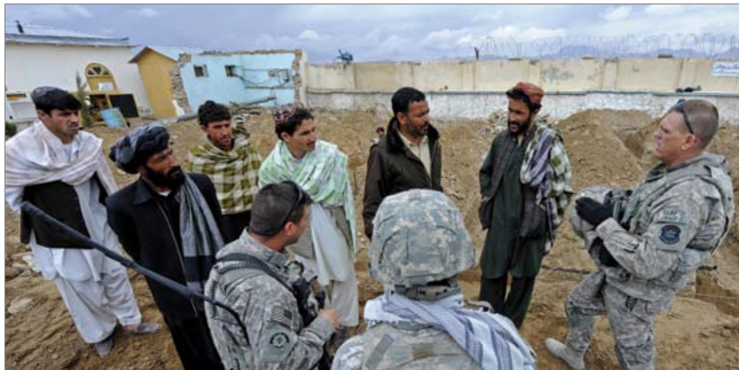
Provincial Reconstruction Team members with Afghan contractors at hospital expansion site.

The number of Defense acquisition professionals declined by 10 percent during a decade that saw contractual obligations triple.