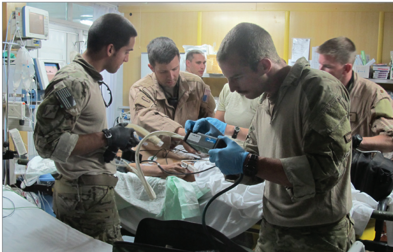
Preparing an injured contractor for transport from a coalition hospital in Herat, Afghanistan.

The extensive use of contractors obscures the full human cost of war. The full cost includes all casualties, and to neglect contractor deaths hides the political risks of conducting overseas contingency operations. In particular, significant contractor deaths and injuries have largely remained uncounted and unpublicized by the U.S. government and the media.