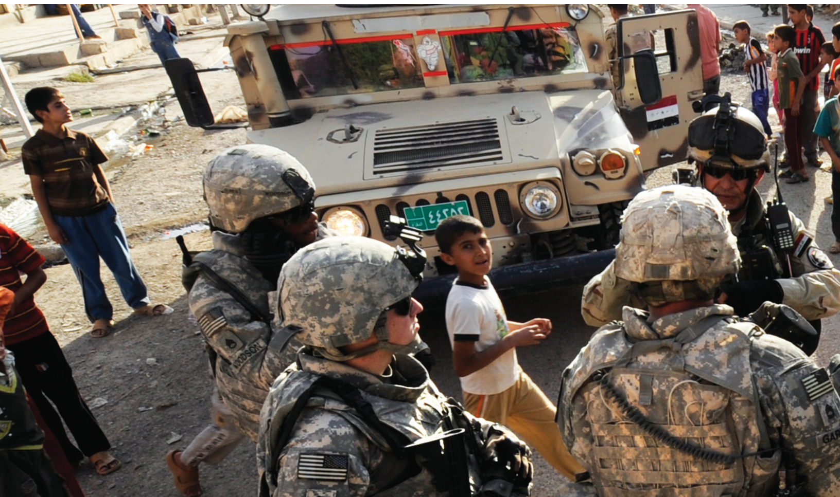
U.S. and Iraqi soldiers, Mosul, Iraq.