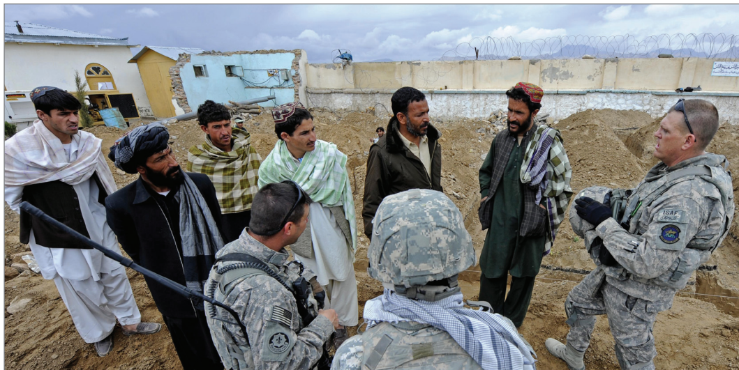
Provincial Reconstruction Team members with Afghan contractors at hospital expansion site.

The number of Defense acquisition professionals declined by 10 percent during a decade that saw contractual obligations triple.